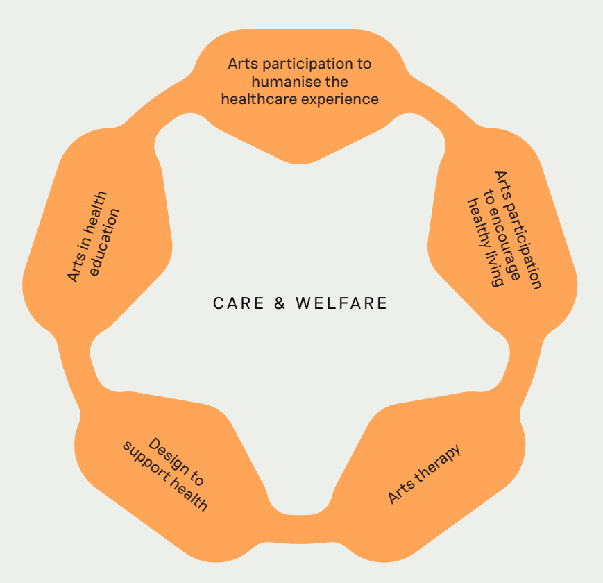
Figure 2. A continuum of arts in health practices for the Netherlands.